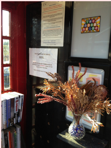
Cotesbach Sat 30 Apr