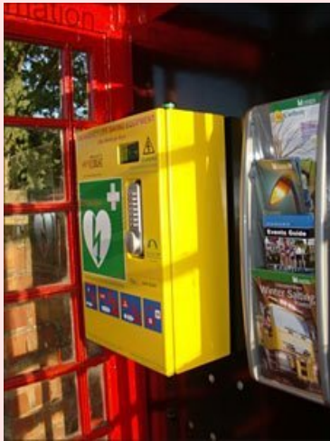
Stourton Wed 27 Apr