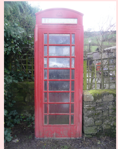
Buxworth Mon 2 May