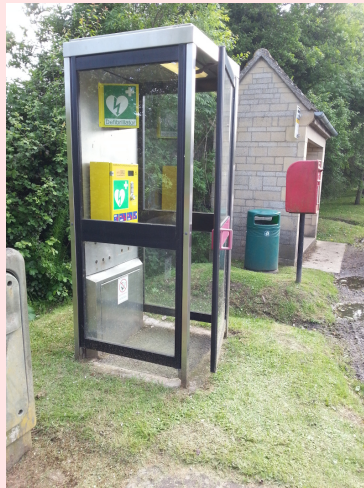
Ewen Thu 28 Apr