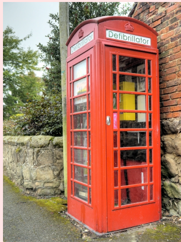
Barrow-on-Trent Sun 1 May